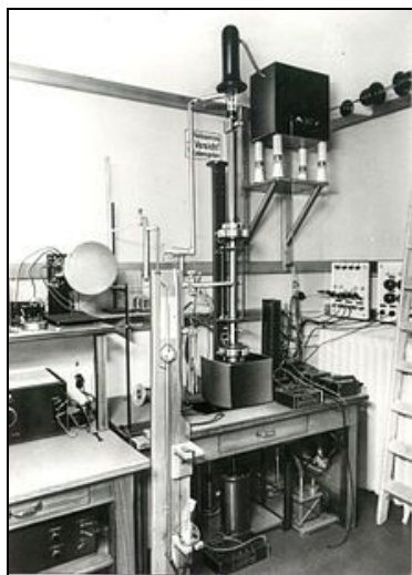
Fig (a): Scanning Electron Microscope

Specimens can be observed in high vacuum, in low vacuum, in wet conditions (in environmental SEM), and at a wide range of cryogenic or elevated temperatures.