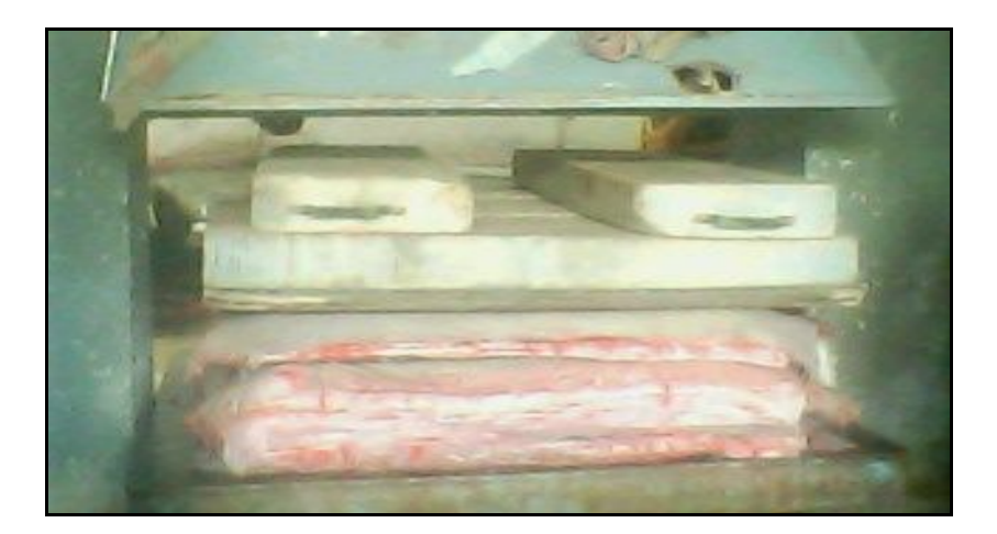
Fig. IV. Hydraulic Compressor