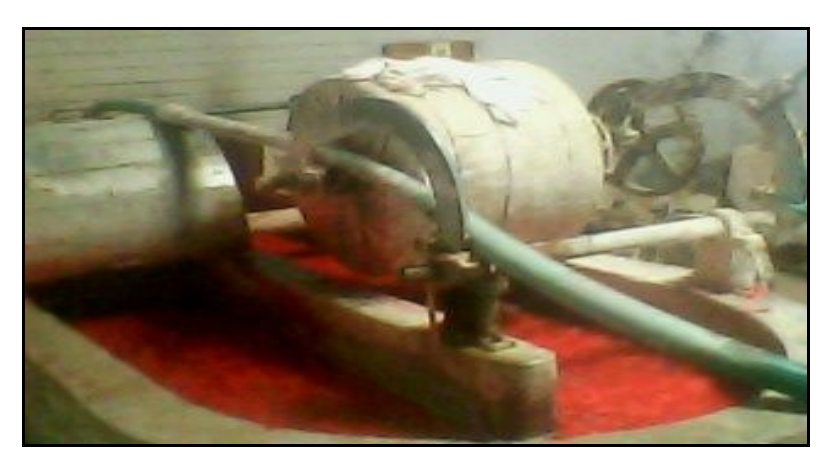
Fig. I. Beater