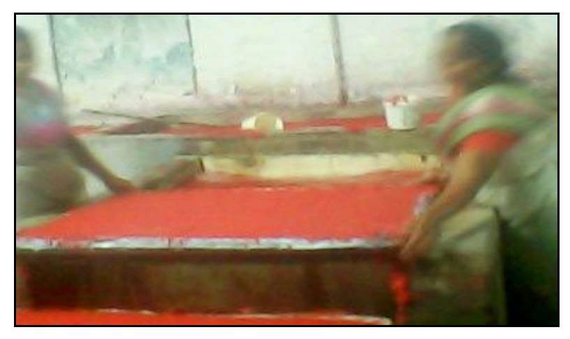
Fig.II. Web Formation

• These pulped fibers are then transferred into the tank which contains 3/4<sup>th</sup> of water. These fibers are then shaken and placed into water on a mesh so that the paper interlocking of the fibers taking place. Then this web is transferred on to nylon net so that the attaching of the web to the net does not take place.