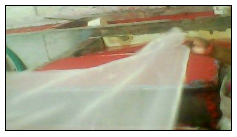
Fig. III. Placing of Net